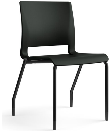
SitOnIt Rio Stacking Chair Classroom Seating