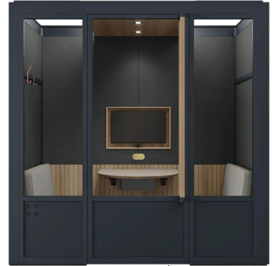
OFS x ROOM Architectural Pod Architectural Solution