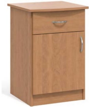
Stance Royale Casegoods Bedside Cabinet Bedside Cabinet