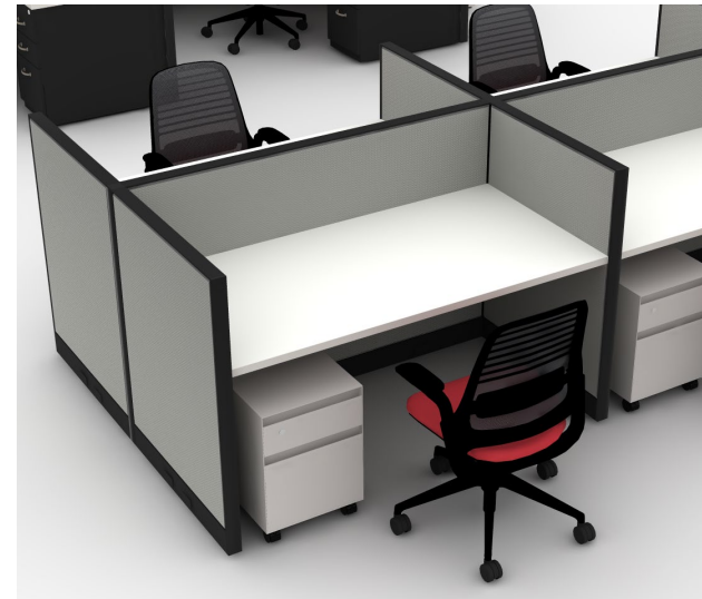
Steelcase Answer Panels, Rectangular Worksurface, Box/File Mobile Storage Preliminary Benching Typical, Finishes TBD