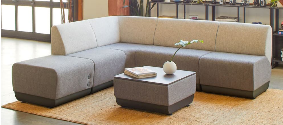
SitOnIt Pasea Lounge Collaborative Modular Lounge