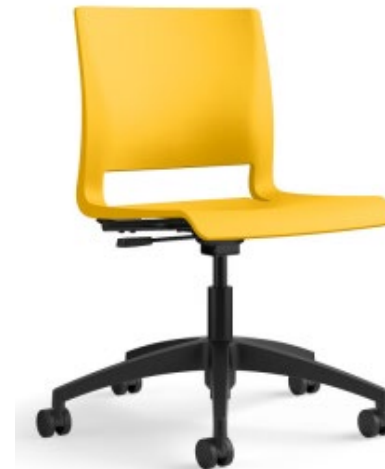
SitOnIt Rio Light Task Chair Instructor's Seating