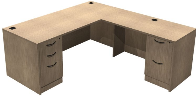
OFGO Modern Laminate Standard Private Office Desk + Casework