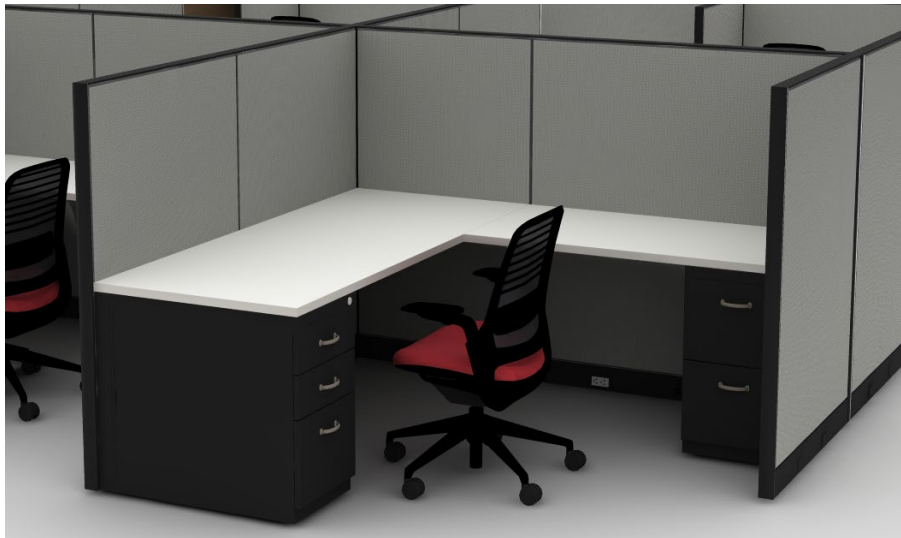
Steelcase Answer Panels, L-Shaped Worksurface, Box/Box/File + File/File Storage Preliminary Workstation Typical, Finishes TBD