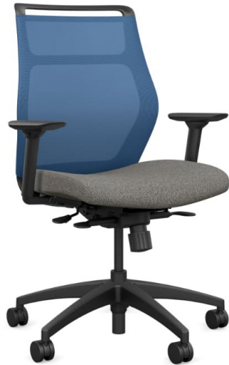
SitOnIt Hexy Midback Task Chair Private Office Task Seating