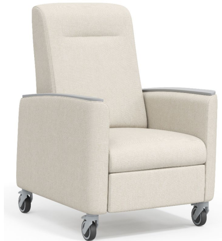
Stance Verity Recliner Health Room Recliners