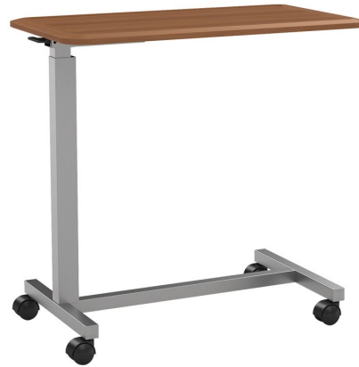
Stance Eclipse Overbed Table Overbed Table