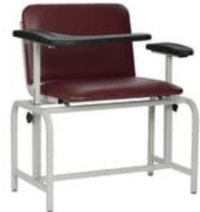
Winco Phlebotomy Chair Phlebotomy Chair