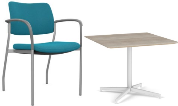
SitOnIt Cora + Parallon Clinic Waiting Room Seating