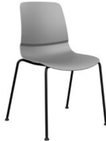
SitOnIt Mika Side Chair Private Office Guest Seating