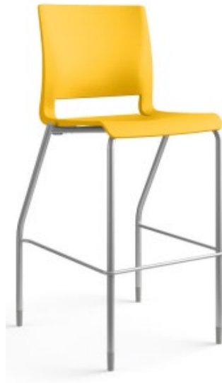
SitOnIt Rio Stool Open Collaboration Seating