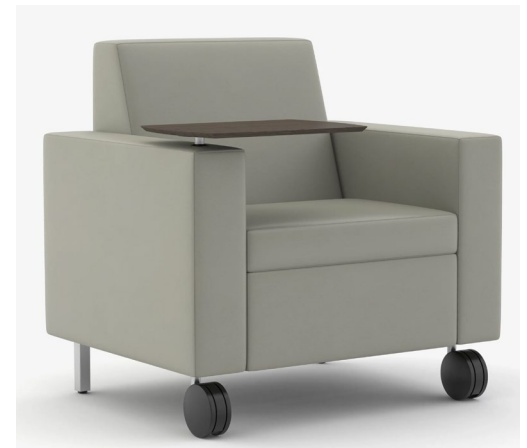
Kimball Villa Health Lounge Student Independent Study