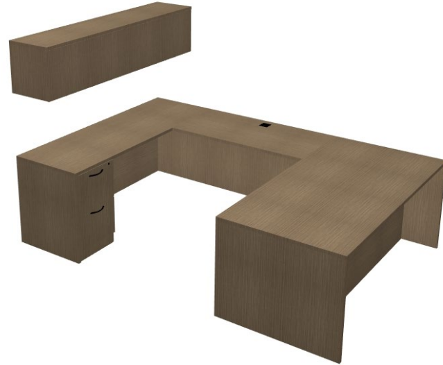
OFGO Modern Laminate Executive Private Office Desk + Casework