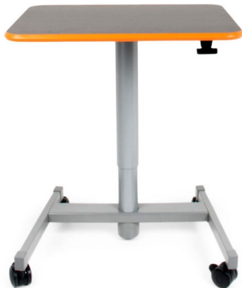
Smith Systems Silhouette Sit-Stand Podium Instructor's Station