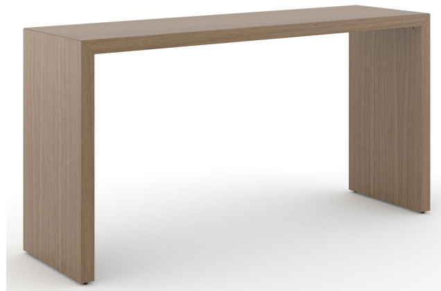
OFS Kintra Table Standing Height Collaboration