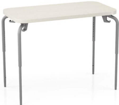
Smith Systems Numbers Desk Classroom Desks