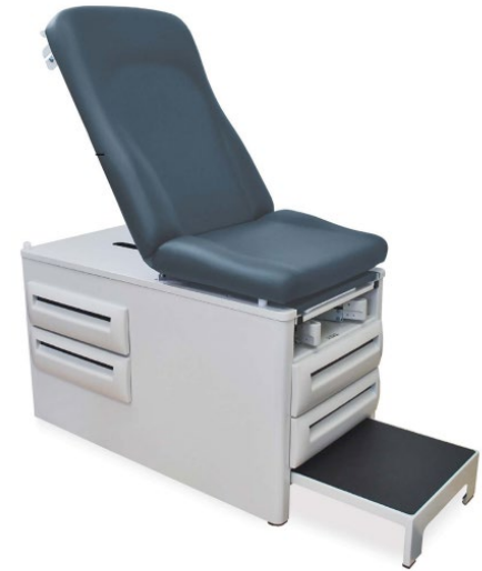
Stance SE6080 Examination Table Exam Tables