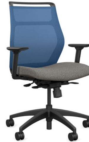
SitOnIt Hexy Midback Task Chair Open Office Task Seating