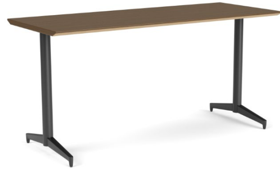
SitOnIt Rectangular Parallon T-Base Table 18"x60" Classroom Tables