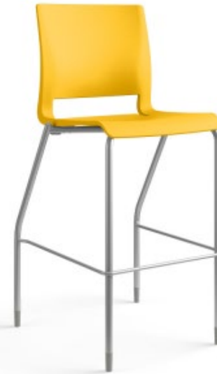
SitOnIt Rio Stool Chemistry Classroom Seating