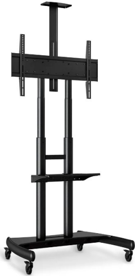
Luxor Adjustable Height TV Stand Classroom Displays