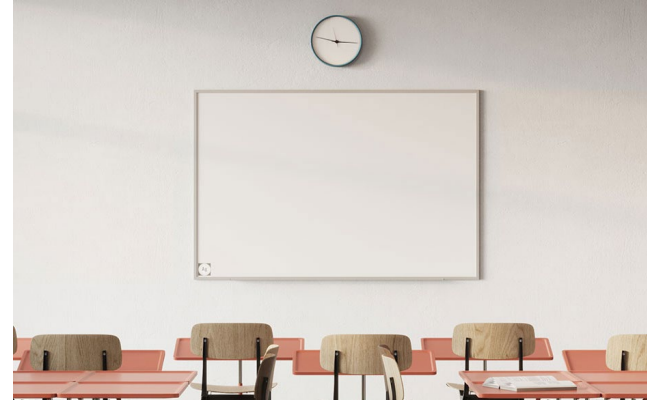
Ghent Magnetic White Board 144"x48" Classroom Displays